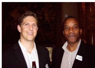
Some snaps of the 2008 Christmas Party