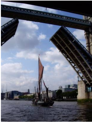
Thames Boat Cruise - September

An uncharacteristically sunny day in September saw the Thames Boat Cruise being a great success as we cruised along past Big Ben and an open London Bridge aboard the Golden Star for the afternoon.